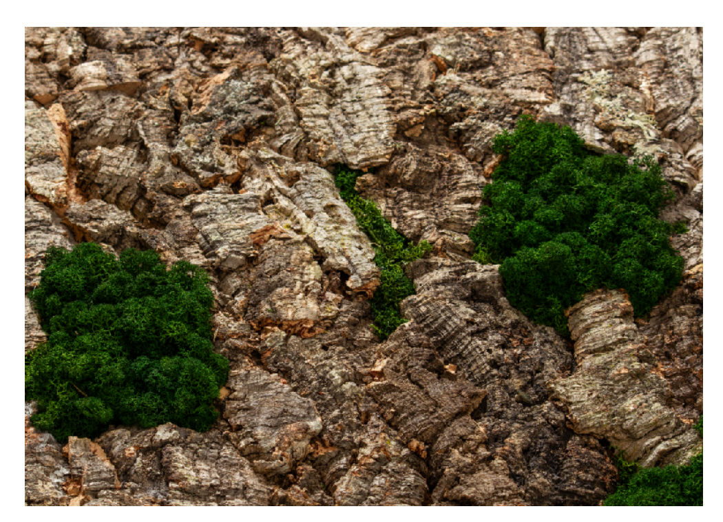
Close-up of Virgin Tree (Natural) with moss