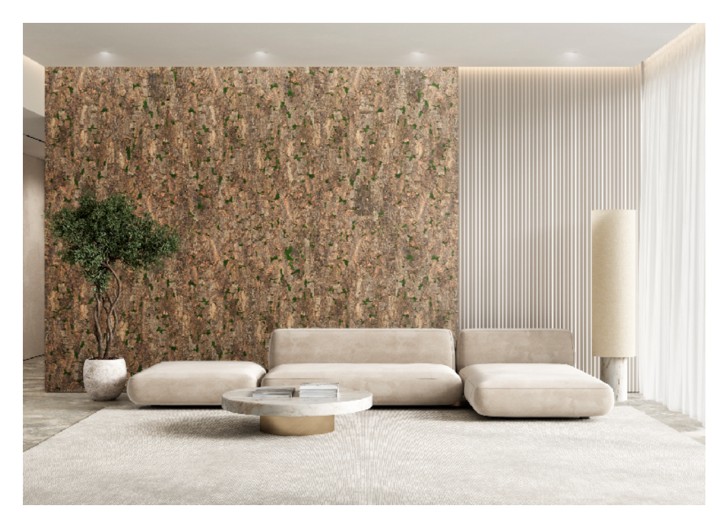
Virgin Tree (Natural) seating area