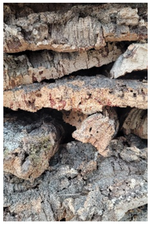
Outer Cork Bark (see VIRGIN TREE)