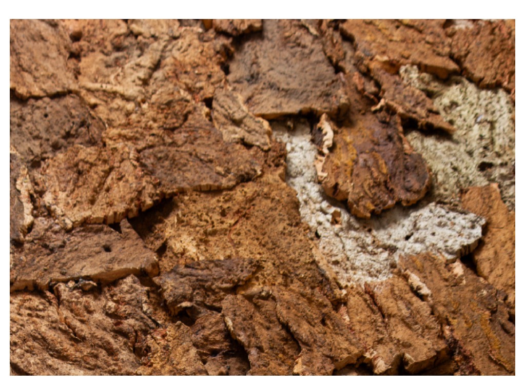
Close-up of Skin Tree (Brown) with moss