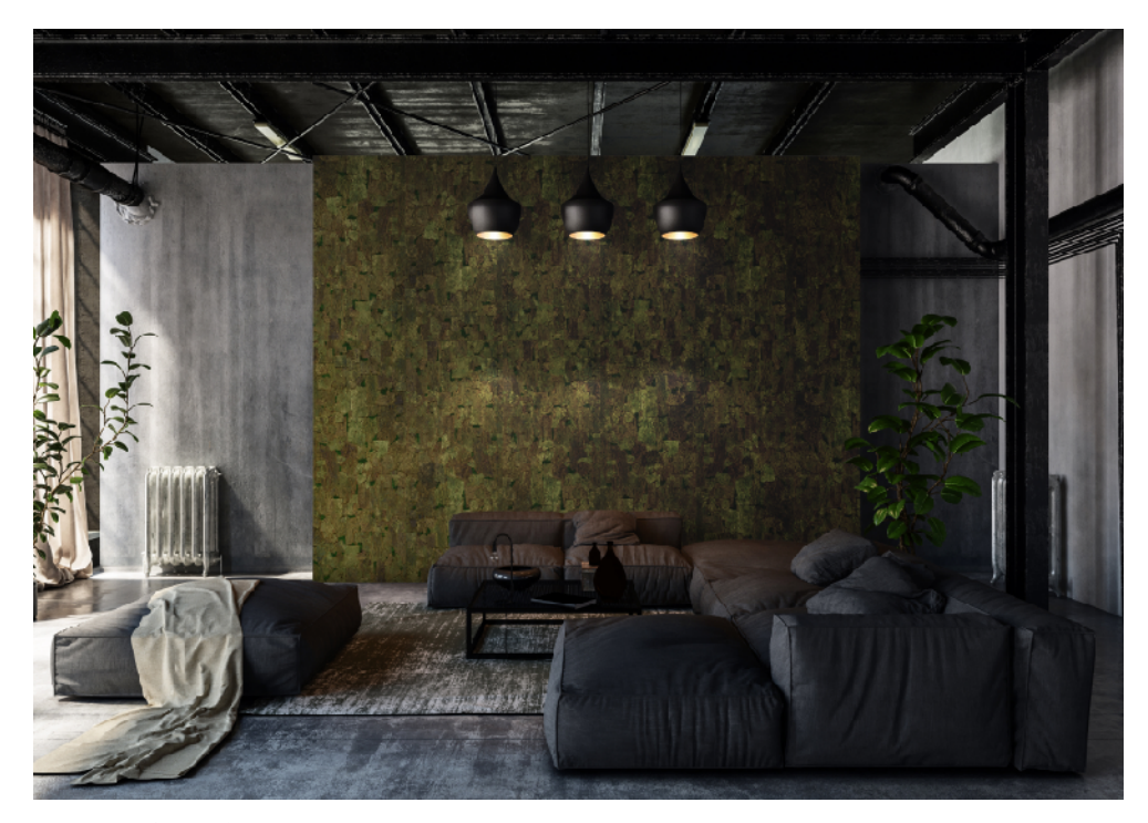
Skin Tree (Green)